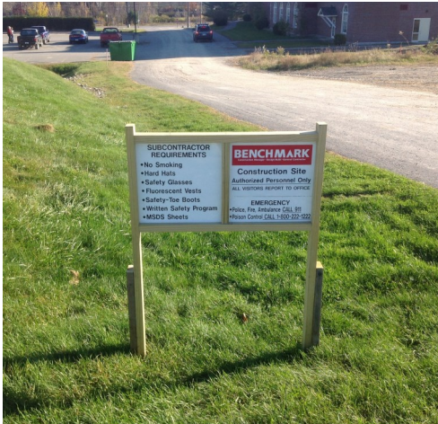
Building a new campus on an old site