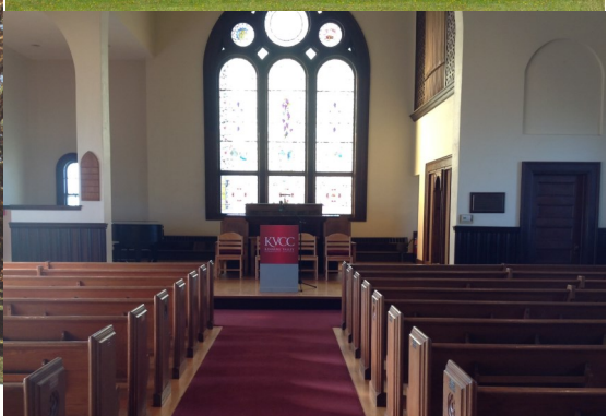
The Frances and Mary E. Moody Memorial Chapel